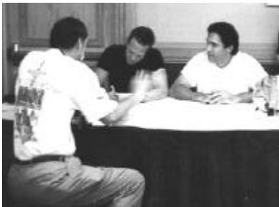
Stan Kirsch & Adrian Paul sign autographs