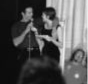
Chemistry on screen and on stage

When asked what his best work as an actor had been, he said that he had just finished an episode called Comes A Horseman with Peter Wingfield that he thought was the best in his career. "Sometimes it can become very real & you can lose yourself in it." But when asked about which roles in Shakespeare he would like to play, he left his options open.