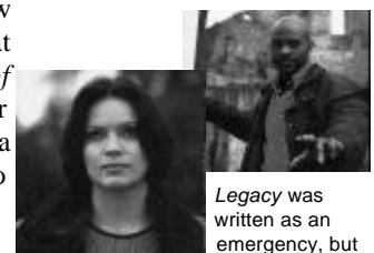
Legacy was written as an emergency, but became a fan favourite