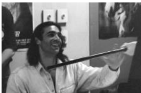
2 hours down, & AP still has a greeting for everyone.